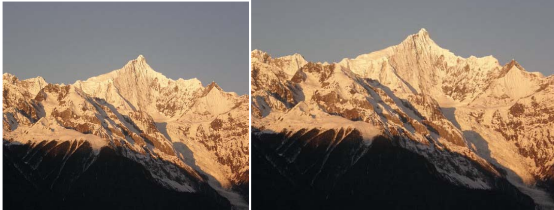
Spectacular Sunrise of Meili Snow Mountains from Felaishi

Day 7 Minyong Glacier (Tue 8 Nov): We wake up early to catch the sun as it rises over the Meili Snow Mountains peaking at 6740m. It will take us two hours to get to a village for Minyong Glacier climb, 2-3 hours trek one-way. Optional horse rides are available to take "non-climbers" up near the top. These mountains are a place of pilgrimage for Tibetans and also another UNESCO Site. ON Felaishi. (One needs to arrange some packed food and snacks (biscuits & chocolates) at provision shops either in Feilashi or in Minyong village. Instant noodles are also available near the top of Minyong Glacier).