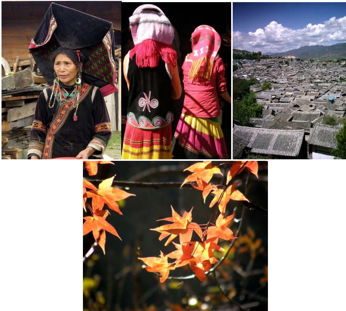
Minorities/UNESCO's Lijiang Old Town /Autumn leaves in Mingyong Glacier

IMPORTANT NOTICE This is meant to be a "free and easy" adventure trip. Participants should be relatively fit, with a good sense of humour, and above all, have the right attitude for close travel with others through possibly some trying times. Most definitely, this is not a trip for prudes, whiners, fuss-pots, and other similiarly assorted types! We had a couple of those before and it wasn't pleasant for us or them. Although every effort will be made to stick to the given itinerary, ground conditions may change and cause some disruption and/or deviation from the norm. Otherwise, have fun.