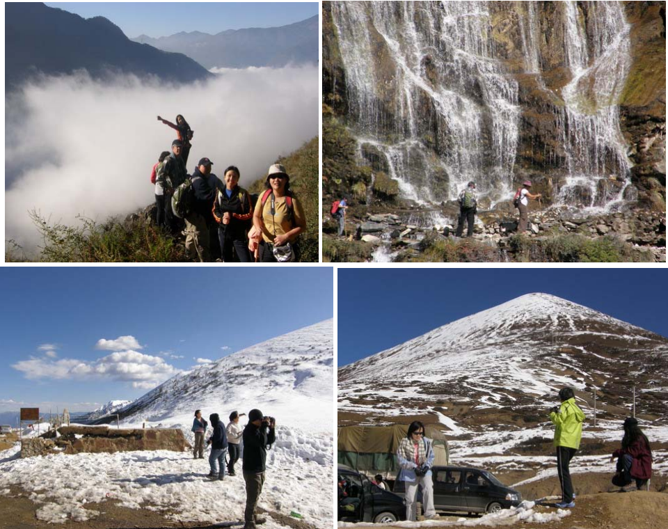
Along the TLG / Snowing on the way to Zhongdian

This trip involves travel by some public buses and an 8 days bus or jeep hire . We stay in a mix of 2 star hotels with attached bathrooms in bigger towns and guesthouses with common or shared bathrooms in smaller places. As with most Yongo trips, you pay for your own meals, entrance fees, horse hires, bicycle hire and other activities.