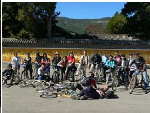
Songzanlin Monastery/ Giant Prayer Wheel in Zhongdian/ Bicycle ride to Baisha Naxi village

Day 5 Zhongdian (Sun 6 Nov): After breakfast, we drive on to Baishutai or White Water Terraces, only one of three places with travertine terraces in the world, before reaching Zhongdian aka Shangri-La. Total drive will be about 5 hr and we will time in the later afternoon to visit the nearby Tibetan Old Town. The Monastery has one of the biggest prayer wheel in the world, sited ontop a hill. ON Zhongdian.